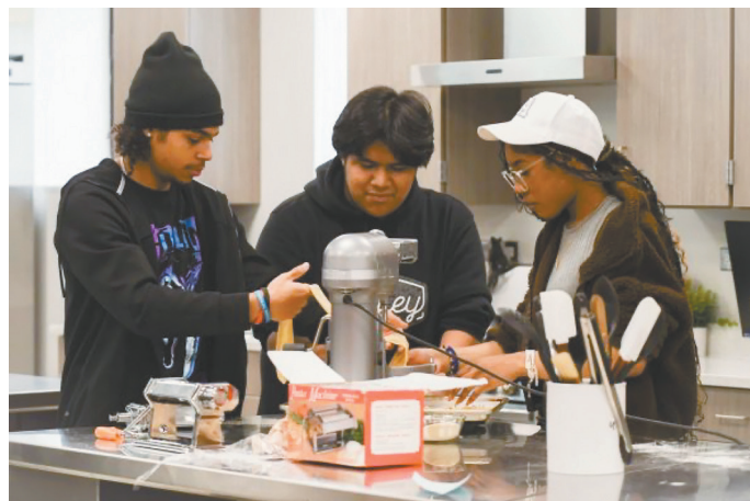
Culinary students practice making pasta. (Siomara Valdez)